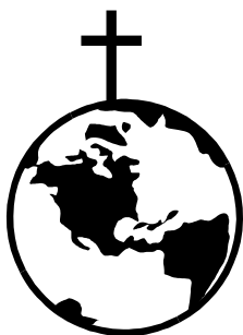
THE THIRD CROSS